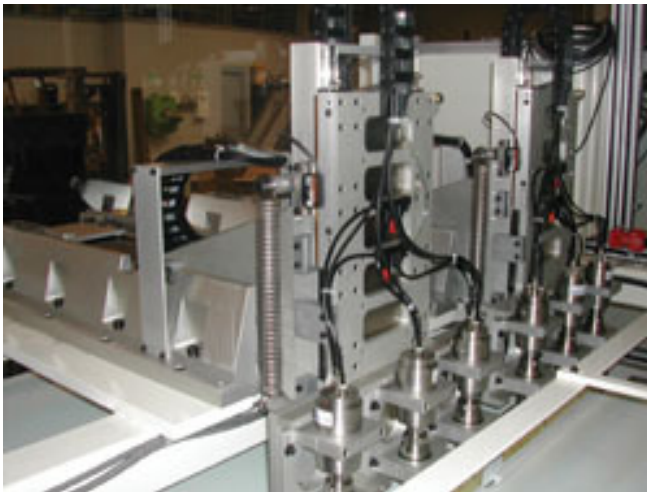
Figure 2: Shift On the Fly

Industrial machine builders who have switched to linear motors on cutting tools, medical devices, packaging pick-and-place machines, and similar high-speed equipment have realized dramatic increases in tool positioning speed and acceleration.