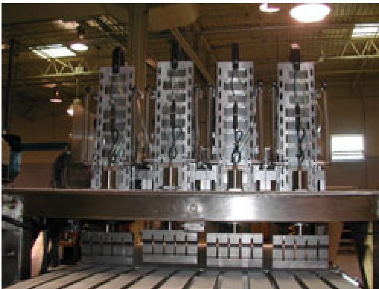
Figure 1: Precise Cuts

It's been two years since a major confectionery customer approached custom machinery manufacturer Trittech Industries ( www.tritech-industries.com ) with a challenge. The food processor wanted to cut a product at very high speed using ultrasonic cutting technology, but also needed a high-quality cut.